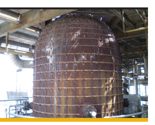
Figure 1: Critical Vessel View