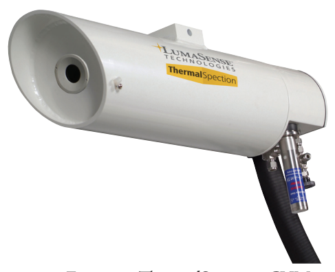
Figure 2: ThermalSpection CVM system